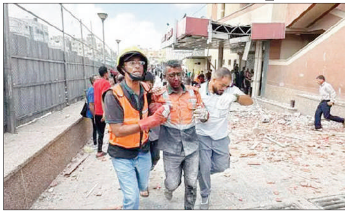
Reuters contractor, was wounded, the news agency reported.