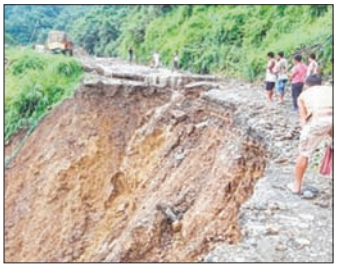
KOHIMA, Aug 25: A massive landslide on NH-2 between Nagaland capital Kohima and Wokha town completely blocked vehicular movement on the busy route on Monday.

The landslide, triggered by continuous rainfall, brought down huge boulders onto the highway, officials said.