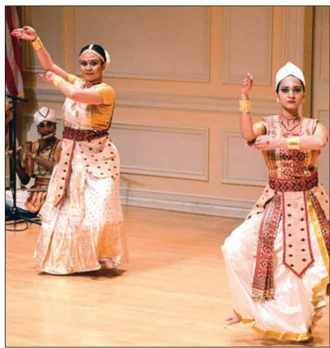
performer and the audience into a shared spiritual experience.

Sattriya dance is accompanied by traditional Assamese music, which includes instruments like the khol (a two-sided drum), taals (cymbals), and the flute. The vocal music consists of Borgeets, the devotional songs composed by Sankaradeva and his disciple Madhavdeva. These songs, sung in Brajavali (a medieval language blending Maithili and Assamese), are rich in poetic and philosophical content, often describing the divine love of Radha and Krishna or the spiritual journey of the soul. The rhythmic structure of Sattriya is based on traditional Assamese tala systems, which provide a complex yet harmonious foundation for the dance. The interplay of music and movement creates a meditative atmosphere, drawing both the