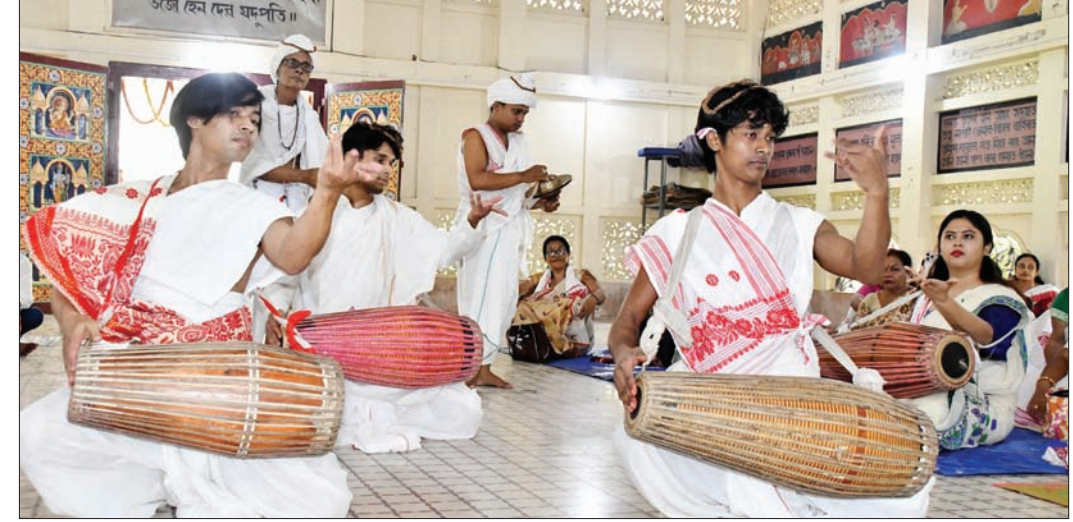
Devotees performing gayan bayan on the occasion of the Tirubhav Tithi of Mahapurush Srimanta Sankardeva at Srimanta Sankar Dev Krishi Vikash Samitee's Namghar in Pallan Bazaar in Guwahati on Monday