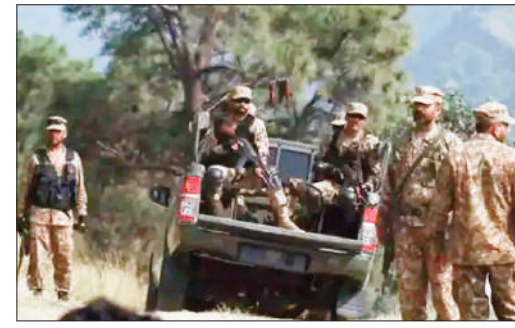
Pakhtunkhwa and Balochistan — both of which share a porous border with neighbouring Afghanistan.

The development comes amid a surge in terrorist attacks across the country, particularly in Khyber