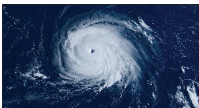
areas, triggering heavy rainfall. On Tuesday afternoon, a dam at a barrier lake in Hualien County overflowed, causing flooding in nearby areas. China's State Flood Control and Drought Relief Headquarters on Tuesday elevated the typhoon

said. In Taiwan, typhoon Ragasa left 14 dead and 18 injured, local authorities said. According to the island's emergency operation centre, about 100 people remain trapped in various parts of the region and are awaiting rescue. As Ragasa moved closer to making landfall, its impact was already being felt in the Pearl River Delta region, according to the National Meteorological Centre. Wind speeds of 212 km per hour were recorded in Zhuhai city. The typhoon's outer circulation continues to lash Taiwan's eastern, northern and southern coastal