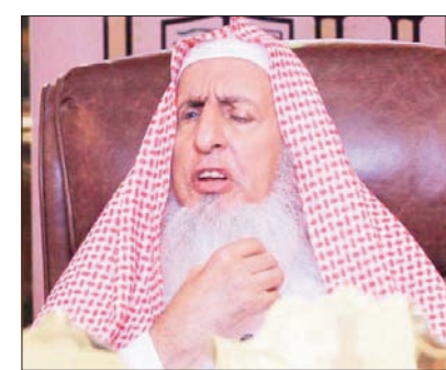
Islam that for decades saw the kingdom segregate the sexes, restrict music and follow other puritanical pursuits.

DUBAI, Sept 24: Sheikh Abdulaziz bin Abdullah al-Sheikh, Saudi Arabia's grand mufti who served the kingdom's top religious figure over a quarter century that saw the ultraconservative Muslim nation socially liberalise has died. The grand mufti, who was in his 80s, died on Tuesday. Sheikh Abdulaziz's role as grand mufti put him as one of the top Islamic clerics in the world of Sunni Muslims. Saudi Arabia, home to the holy cities of Mecca and Medina, hosts the annual Hajj pilgrimage required of all able-bodied Muslims once in their lives, making the pronouncements of the grand mufti that much more closely followed. While closely aligned to Al Saud ruling family, which has allowed women to drive, opened movie theatres and further socially liberalised in recent years, Sheikh Abdulaziz denounced extremists like those in the Islamic State group and al-Qaida. He also made pronouncements during his time as grand mufti viewed as sectarian and more following Saudi Arabia's Wahhabism, a strictly austere form of