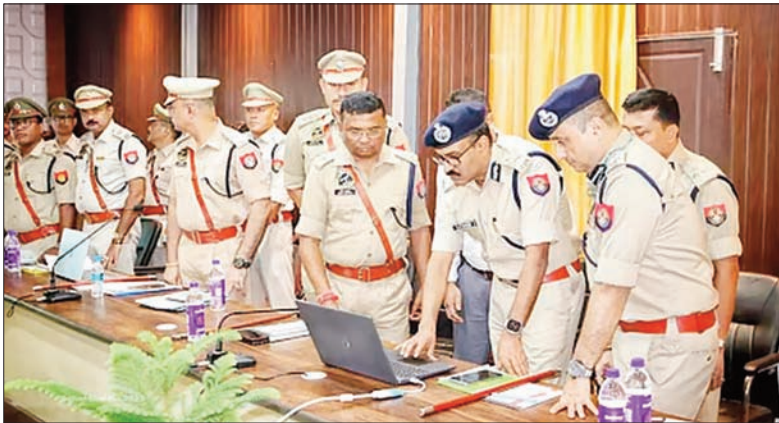
ADGP, CID along with senior officers including Chief Secretary, Assam, Sarma said in a post on X. "I have instructed the DGP to con-

GUWAHATI, Sept 24 : Chief Minister Himanta Biswa Sarma on Wednesday said he has asked the state's director general of police to form a Special Investigation Team (SIT) to probe into the untimely death of cultural icon Zubeen Garg in Singapore last week. The Criminal Investigation Department (CID) of Assam Police is currently probing the case of Garg's death after more than 60 FIRs have been lodged across the state against organisers of the Northeast India Festival, where the singer had gone to perform. "In regard to the untimely death of our beloved Zubeen Garg, we will not spare anyone. Today, I had a meeting with the @DGPAssamPolice and the