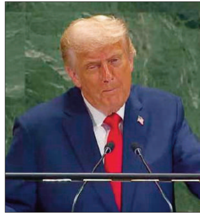
stalled following a diplomatic blitz last month, when he held a summit with Putin and a White House meeting with Zelensky and European allies.

if it sticks, is a huge win for Zelensky, who has urged the American president to keep up the pressure on Russian President Vladimir Putin to end his brutal war. It was a departure from Trump's previous suggestions that Ukraine would never be able to reclaim all the territory that Russia has occupied since seizing the Crimean Peninsula in 2014. That had disheartened Zelensky, Europeans and Ukrainians and called into question the US commitment to UN principles of sovereignty and territorial integrity. But now, Trump's view of the battlefield coincides more with Ukraine's, Zelensky said. "Trump is a game changer by himself," Zelensky told reporters after their meeting. Trump needles Russia about war in Ukraine Trump, going back to his 2024 campaign, insisted he would quickly end the war, but his peace efforts appear to have