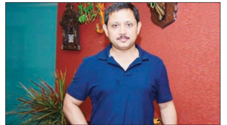
the Centre not to extend any financial assistance or sponsorship to him in any manner," the CM said. The North East Festival is being sponsored by several central government ministries and also gets support from almost all the northeastern state governments. Garg's body was consigned to flames with full state honours amid chanting of Vedic hymns as thousands of fans sang his songs to bid farewell to the icon in the sylvan surroundings of Kamarkuchi on the outskirts of Guwahati on Tuesday.