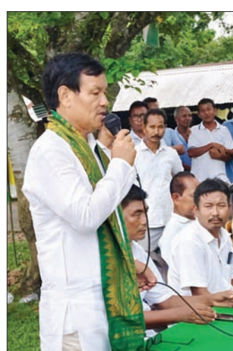
HT Correspondent KOKRAJHAR, Sept 18: With the Bodoland Territorial Council

(BTC) elections scheduled for September 22, campaigning has picked up pace across the region. In the Kachugaon constituency, Cabinet Minister Urkhao Gwra Brahma has actively participated in a series of pocket campaigns supporting UPPL candidate Ukil Muchahary. The outreach programmes, held across various villages and localities, witnessed enthusiastic public participation. During the visits, Urkhao Gwra Brahma interacted with voters, addressing their concerns and emphasising the UPPL's commitment to peace, stability, and inclusive development in the Bodoland Territorial Region (BTR). He highlighted the achievements of the UPPL-led administration and urged people to support