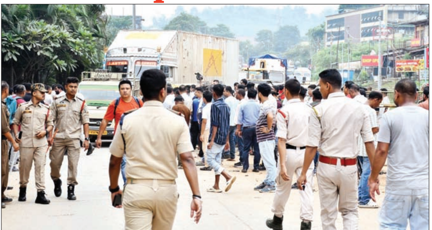
He called for calm and dialogue, urging both sides to find an amicable solution to prevent further escalation and ensure the safety of commuters and residents along the border.