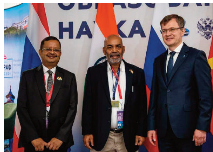
on the occasion.