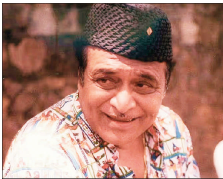
Hazarika as an eternal cultural icon. "On his 100th Birth Anniversary, I

Deputy Chief Minister Chowna Mein also paid homage, describing