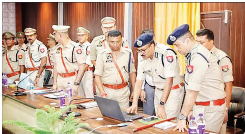
ADGP, CID along with senior officers including Chief Secretary, Assam, Sarma said in a post on X. "I have instructed the DGP to con-

"In regard to the untimely death of our beloved Zubeen Garg, we will not spare anyone. Today, I had a meeting with the @DGPAssamPolice and the