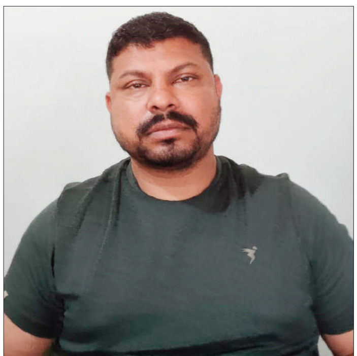
The racket came to light after more than 30 complaints were lodged against the accused. During a late-night operation on

According to police, the modus operandi involved targeting owners of four-wheelers, particularly Bolero pickup vehicles, with promises of paying bank EMIs or monthly rentals as syndicate members would sign agreements, offer advance payments, and keep up with installments for a few months to gain trust and thereafter, the vehicles would be diverted and sold through fraudulent transfers in other states.