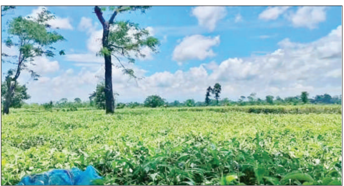
STAC) were found to be non-compliant with FSSAI standards this year, as per FAITTA (Federation of All India Tea Traders' Association).

Adding to the industry's challenges, the ATPA chairman pointed out that a significant portion of teas listed at the Guwahati and Siliguri Tea Auction Centres (GTAC and