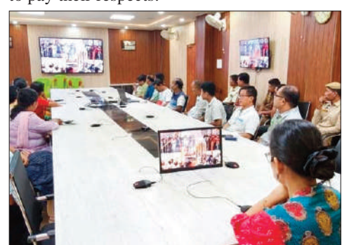
tribution to Assamese music, cinema, and culture.