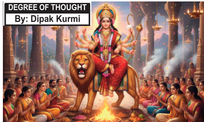
DEGREE OF THOUGHT

Fasting, however, is not merely a dietary choice; it is an act of self-discipline and renunciation. It sharpens willpower, enhances clarity, and directs mental energy towards the divine. When combined with mantra chanting, meditation, and prayer, fasting becomes a tool for dissolving mental fog, calming emotional turbulence, and erasing negative thought patterns. It is as much a psychological and spiritual practice as it is a physical one. Ancient scriptures describe