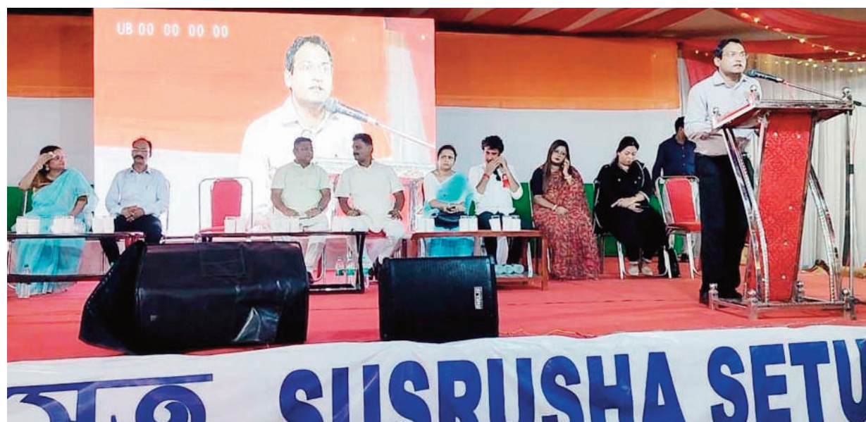
ening their will to complete treatment. He stressed that no one in Silchar should fight TB alone and urged Cachar to set an example in fulfilling the Prime Minister's vision of a TB-free India by 2025.