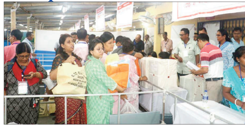
81.61%, Sorabil (ST) at 79.90%, and Debargaon (ST) at 76.97%.

Among the constituencies, Parbatjhora (ST) saw the highest voter turnout at 87.59%, followed by Srirampur (Non-ST) at 86.96%, Fakiagram (Non-ST) at 85.60%, and Guma (Open) at 84.57%. Other constituencies also recorded strong participation: Banargaon (ST) at 82.84%, Dotma (ST) at 82.33%, Jamduar (ST) at 82.23%, Baukhungri (ST) at 82.02%, Kachugaon (ST) at 82.07%, Salakati (ST) at