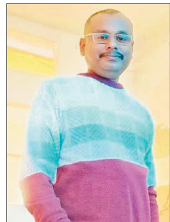
him to Demow Model Hospital, where the attending doctor declared him brought dead. He had sustained a head injury.