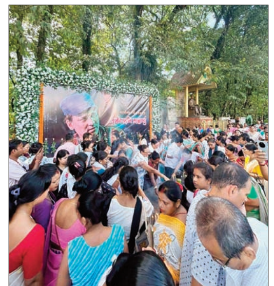
On Tuesday in a symbolic gesture of connection, the Margherita Municipal Board hosted a live broadcast from the Eco Park, enabling people across the region to join in the final tribute. Thousands gathered once more, eyes fixed on glowing screens under the afternoon sun, as Zubeen's music played on in solemn loops.

As thousands marched arm-in-arm, their voices rose in harmony, singing Zubeen's timeless hits like "Mayabini" and other Assamese ballads of love and longing. These were not mere processions—they were soulful pilgrimages, forged in unity, love, and an unshakable bond of humanity.