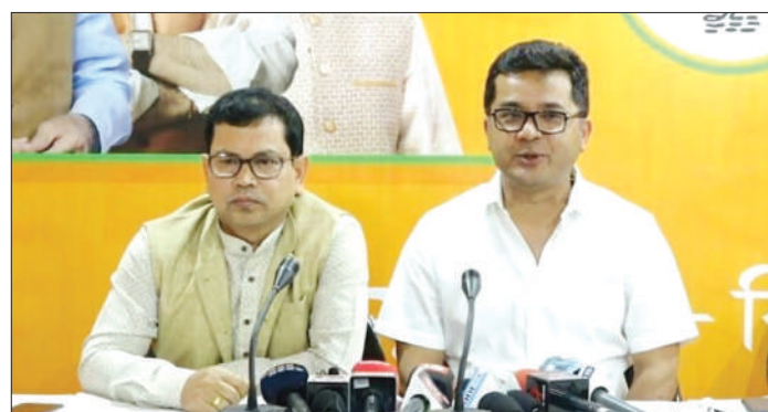
manta Sankardeva Kalakshetra.

He recalled the anti-CAA movement, alleging that emotional manipulation by certain groups had led to loss of innocent lives, widespread unrest, and even damage to cultural landmarks such as Sri-