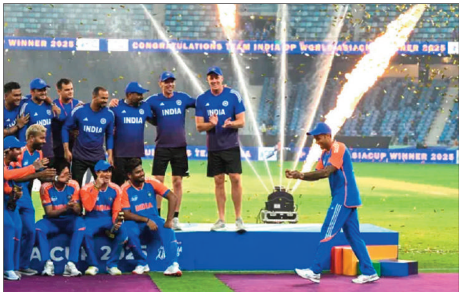
By: Dr Priyanka Saurabh

The final match of the Asia Cup 2025 was not just a thrilling game of cricket. It became more than just a game, a diplomatic and cultural message. India not only defeated Pakistan on the field but also adopted a stance during the post-match formalities that captured global attention. The Indian players flatly refused to accept the trophy from the President of the Asian Cricket Council, who is from Pakistan. As a result, the prize distribution ceremony dragged on for hours and ultimately remained incomplete. This incident marks a turning point in the history of Indian cricket. The question is not just who held the trophy, but why India took this step and what its consequences are.