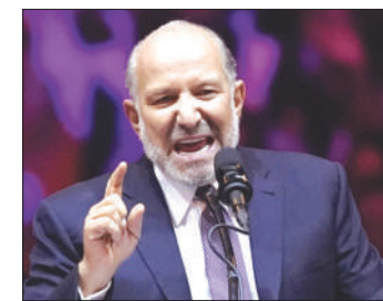
economy, and they sell to us while we are wide open for them to come in (and) take advantage," Lutnick said. "The president says, 'fair and reciprocal trade,'" he added. "India brags that they have 1.4 billion people. Why won't 1.4 billion people buy one bushel of US

NEW YORK/WASHINGTON, Sept 14: India brags about having 1.4 billion people but won't buy even a small amount of American corn, Commerce Secretary Howard Lutnick has said, asserting that New Delhi must bring down its tariffs or face a "tough time" doing business with the US. Lutnick made the comments during an interview on Saturday when he was asked whether the US is mismanaging "very valuable relationships" with "important allies" like India, Canada and Brazil with the tariffs imposed on these countries. "The relationship is one way, they sell to us and take advantage of us. They block us from their