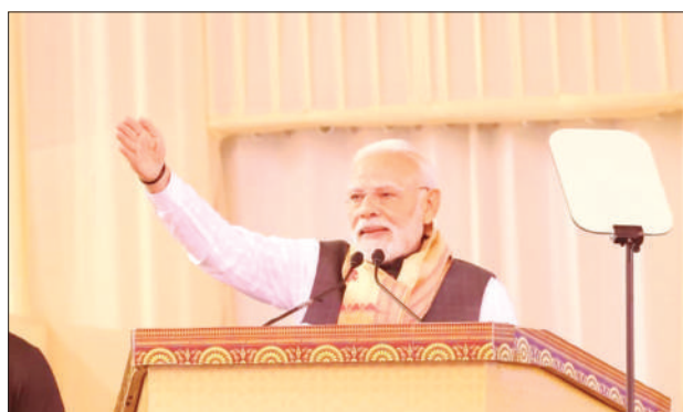
570 crore, the Guwahati Ring Road (₹ 4,530 crore) and the Kuruwa-Narengi bridge over Brahmaputra (₹ 1,200 crore), officials said.

HT Bureau GUWAHATI, Sept 14: Prime Minister Narendra Modi on Sunday launched projects worth ₹ 18,530 crore in Assam, including the world's first bio-ethanol plant using bamboo as raw material, along with major health and infrastructure projects at programmes in Darrang and Golaghat districts. In Darrang district's Mangaldoi town, the PM laid foundation stones for three major projects with an investment of ₹ 6,300 crore. These include the Darrang Medical College and Hospital, along with a GNM school and nursing college at a cost of ₹