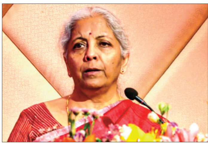
NEW DELHI, Sept 14: Finance Minister Nirmala Sitharaman has said...

attracted ₹ 82,000 crore through foreign direct investment (FDI).