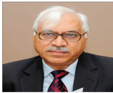
Chief Election Commissioner (CEC) between July 30, 2010 and June 10, 2012.

"When I see that institution under attack or weakened in any way I feel concerned and the EC itself has to do introspection and has to feel concerned. It is up to them to stand up to all the forces and the pressures that may be influencing their decisions," said Quraishi, who was the