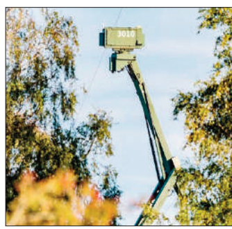
currently no civil aviation in Karup.

DR said that for a period of time the airspace was closed to civil air traffic, but that did not have much practical significance as there is