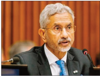
NEW YORK, Sept 27: External Affairs Minister S Jaishankar has called on BRICS to defend the multilateral trading system amid increasing protectionism

and tariff volatility during a meeting of the bloc's foreign ministers here on the sidelines of the UN General Assembly session.