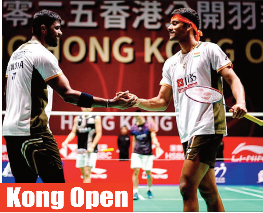
Hong Kong Open

A couple of errors from Chirag gave the Taiwanese a 10-8 cushion, only for Satwik