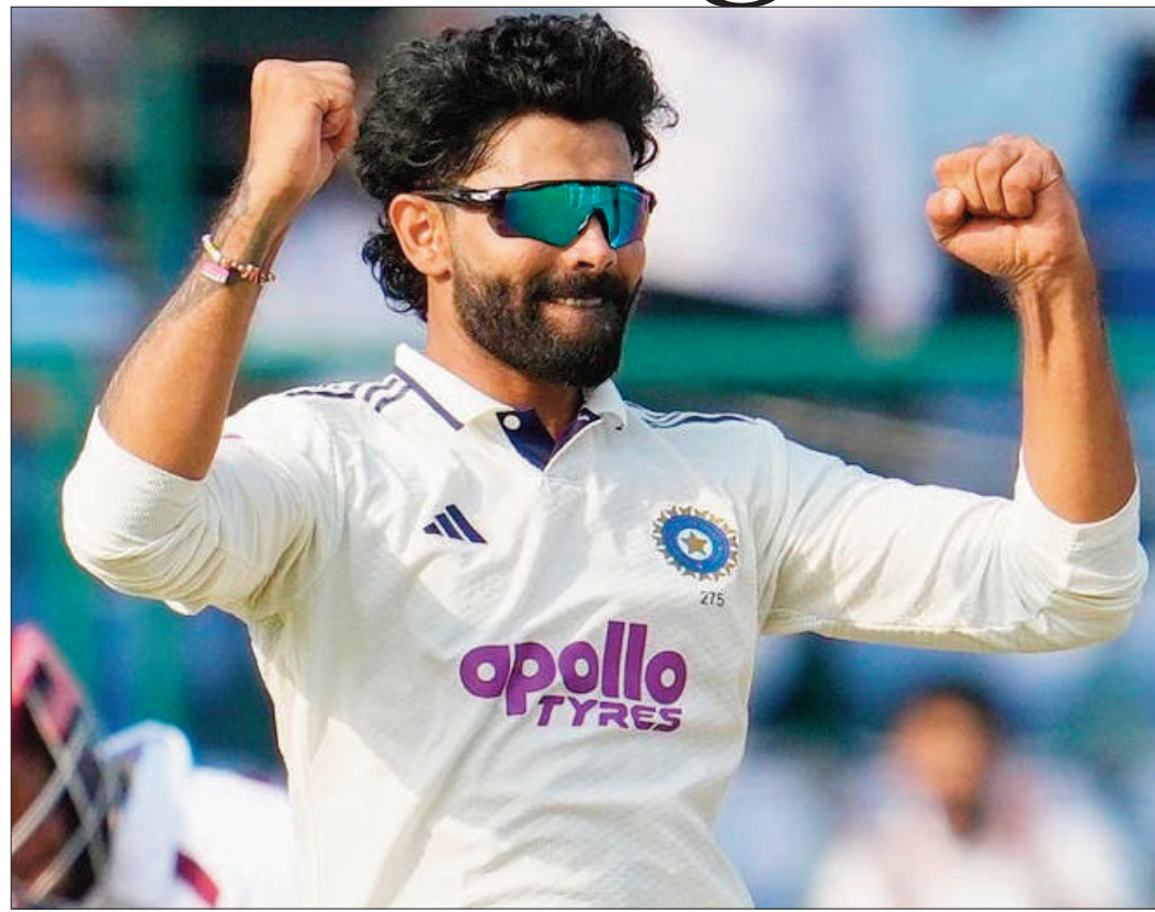
on spinners Kumar Kartikeya, Shubham Sharma and Saransh Jain to keep Saurashtra on the backfoot.

They had nearly spun MP to a win over Punjab, plucking five wickets in the second innings be-