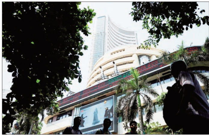
Mahindra Bank, Adani Ports, Titan, HDFC Bank and Axis Bank were also among the laggards.

Among Sensex firms, Hindustan Unilever dropped the most by 3.20 per cent. UltraTech Cement, Kotak