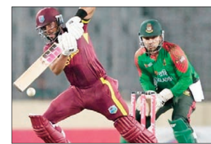
Bangladesh claim its first ODI series triumph since March 2024. In between, it has lost four such encounters.

The dominant victory, its second largest overall and biggest ever against the Caribbean side, helped