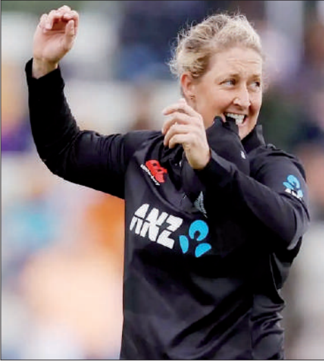
NAVI MUMBAI, Oct 24: With WPL finding its pride of place in the calendar, India in future can be at the forefront of where women's cricket can

potentially reach, legendary New Zealand skipper Sophie Devine said after her team's defeat to India which dashed their hopes of reaching World Cup semi-final.