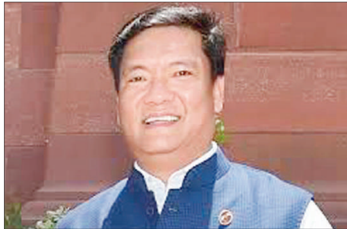
ITANAGAR, Oct 27: Chief Minister Pema Khandu on Monday paid tribute to the nation's infantry personnel, lauding their courage and commitment to safeguarding India's frontiers.

In a post on X, Khandu praised the infantry for embodying patriotism and standing as the first line of defence of the country.