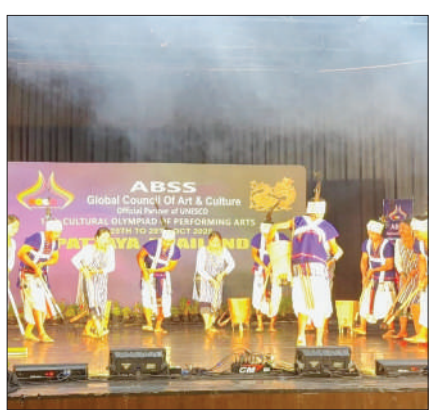
HT Bureau DIPHU, Oct 27: A 12-member Karbi cultural troupe showcased a medley of traditional Karbi dances on the world stage at the ongoing five-day 15th Cultural Olympiad of Performing Arts, being held from October 25 to 29 at Burapha University, Pattaya, Thailand. The troupe performed Ritong Chingdi (cultivation dance), Han Up Ahi Kebi (community bamboo shoot collection dance), Lengpum Sokhon (paddy pounding dance), and Hacha Kekan (post-harvest dance), depicting the agrarian life and cultural heritage of the Karbi community. The performance, staged before a packed audience at 6 p.m., drew attention for its distinct rhythm, traditional music and vibrant at-