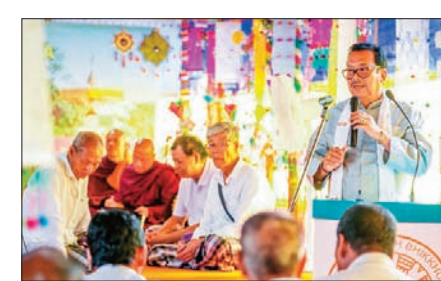
from diverse communities, highlighting their unity and shared commitment to the welfare of the student community. He also emphasized the region's growing prominence in sports, arts, and

He lauded the participation of student leaders