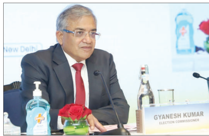
NEW DELHI, Oct 27: Chief Election Commissioner Gyanesh Kumar on Monday said separate provisions of the Citizenship Act apply in Assam, and a special order will be issued for the special intensive revision of electoral rolls in the state.