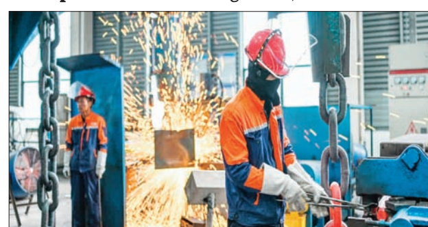
Industrial output growth remains steady at 4 pc in Sept on manufacturing boost, GST rate cuts

Travel Ka Muhurat seeks to define this period as India's annual moment for travel preparation, encouraging customers to act on their vacation plans through curated offers and destination inspiration.