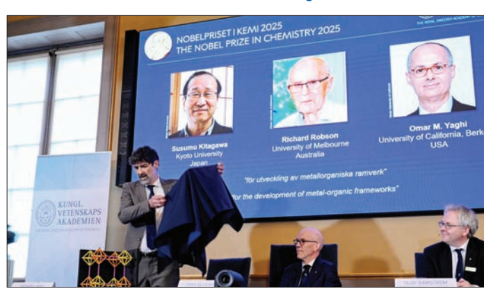
prize in Stockholm. It was the third prize announced this week. "These constructions, metal-organic frameworks, can be used to