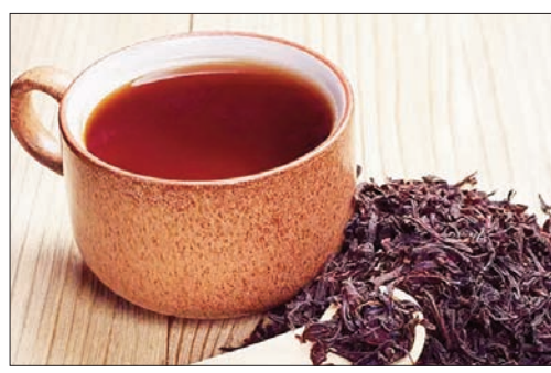
Caffeine, a key component of tea, can cause health issues such as sleep disturbances, anxiety, cardiovascular concerns, and diuretic effects. The decaffeina-

According to a press communiqué issued by CSIR-NEIST, the tea was unveiled during the two-day 'CSIR Super Model Store' event held from September 24 to 26 at Dilli Haat, New Delhi, as part of the 84th CSIR Day celebrations. The event showcased and sold products from various entrepreneurs and industries across India based on CSIR technologies.