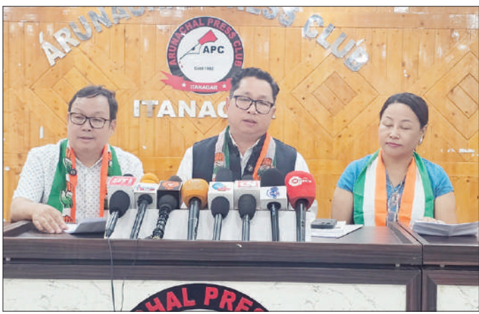
and dignity," he said.

"The RTI has been a lifeline for marginalized sections of society, helping citizens secure their rightful ration entitlements, pensions, unpaid wages, and scholarships. It has ensured that the poorest are not denied basic necessities, turning information into a tool for justice