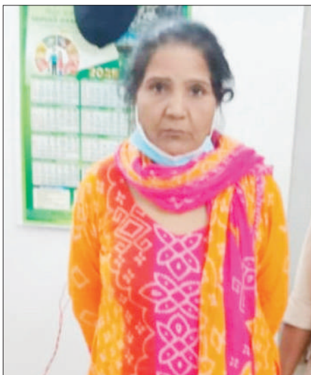
Pakistan via Bangladesh.

Preliminary questioning revealed that she had claimed to be a Pakistani national from Punjab province who entered Bangladesh three years ago, before illegally crossing into India through West Bengal with the help of an agent. She also stated that she had been working as a domestic help in Delhi and was attempting to return to