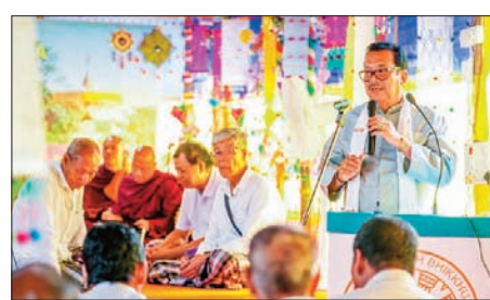
from diverse communities, highlighting their unity and shared commitment to the welfare of the student community. He also emphasized the region's growing prominence in sports, arts, and

He lauded the participation of student leaders