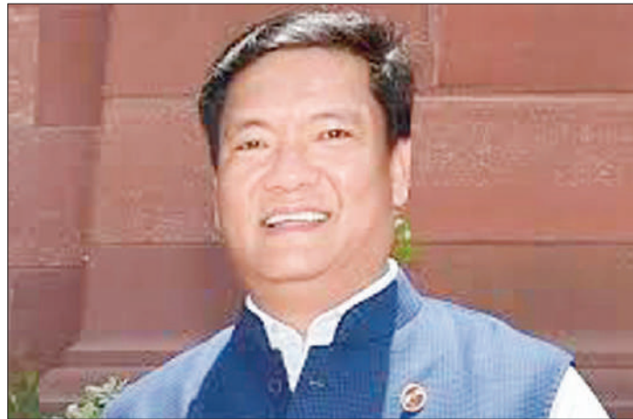
ITANAGAR, Oct 27: Chief Minister Pema Khandu on Monday paid tribute to the nation's infantry personnel, lauding their courage and commitment to safeguarding India's frontiers.

In a post on X, Khandu praised the infantry for embodying patriotism and standing as the first line of defence of the country.