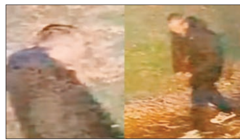
British Sikh woman in the nearby Oldbury area.

The attacker is described as white, in his 30s, with short hair and wearing dark clothing at the time of the attack. While the police are yet to confirm further details, local community groups have claimed that the victim is a Punjabi woman and expressed concerns as the latest attack comes weeks after the racially aggravated rape of a