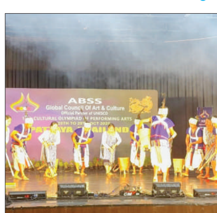
HT Bureau DIPHU, Oct 27: A 12-member Karbi cultural troupe showcased a medley of traditional Karbi dances on the world stage at the ongoing five-day 15th Cultural Olympiad of Performing Arts, being held from October 25 to 29 at Burapha University, Pattaya, Thailand. The troupe performed Ritnong Chingdi (cultivation dance), Han Up Ahi Kebi (community bamboo shoot collection dance), Lengpum Sokchon (paddy pounding dance), and Hacha Kekan (post-harvest dance), depicting the agrarian life and cultural heritage of the Karbi community. The performance, staged before a packed audience at 6 p.m., drew attention for its distinct rhythm, traditional music and vibrant attire.