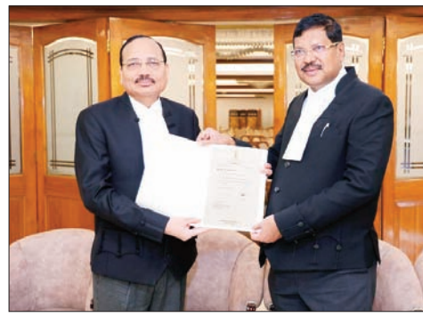
Justice Surya Kant brings to the country's top judicial office a wealth of experience spanning

Justice Surya Kant, born in a middle-class fam-