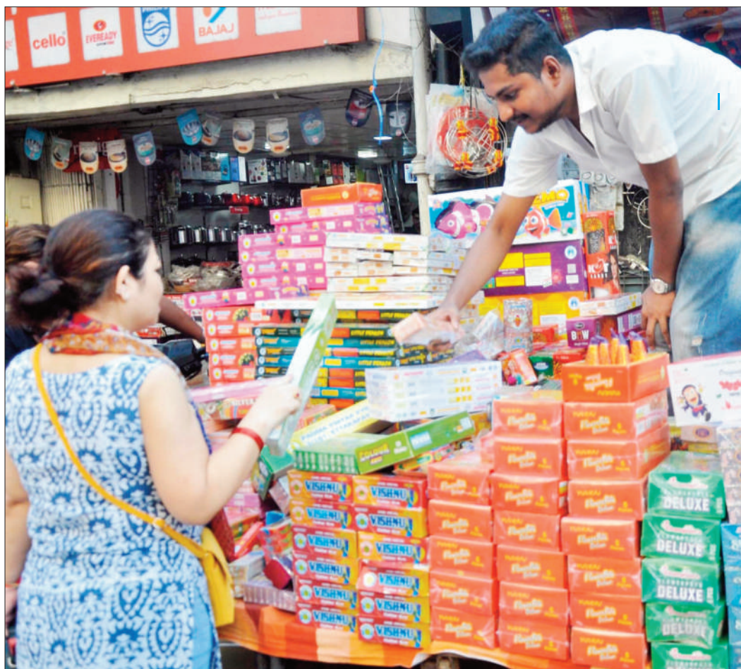
People buying diwali items on the eve of Diwali at Fancy Bazar in Guwahati on Saturday.

The running of these special trains will help clear the extra rush of passengers travelling to and from various areas, including the Northeast, North Bengal, and Bihar. Passengers are advised to check detailed timings, stoppages, and coach compositions from official railway sources before planning their journey.