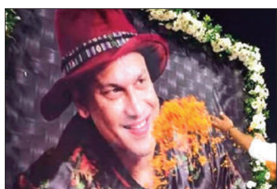
The Indian government had earlier invoked the Mutual Legal Assistance Treaty (MLAT) with Singapore, seeking cooperation in the investigation into the death of the singer. The Singapore Police Force (SPF) is also carrying out an independent investigation into the incident.

"Linking the series of events with the place of occurrence is one of the most important aspects of the entire investigation process. Besides, the Assam Police team will sit with their counterparts in Singa-