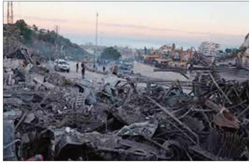
combatants, said spokesperson Thameen Al-Kheetan.

Lebanon's health ministry has reported more than 270 people killed and around 850 wounded by Israeli military actions since the ceasefire. As of October 9, the UN human rights office had verified that 107 of those killed were civilians or non-