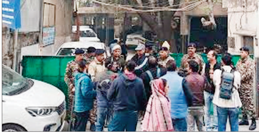
The official said "key" personnel overseeing finance and administration of the trust and the University have also been covered in the raids.

"The operation forms part of an ongoing investigation into financial irregularities, use of shell companies, accommodation entities and money laundering. The role of Al-Falah Trust and related entities is under investigation," an ED official said.