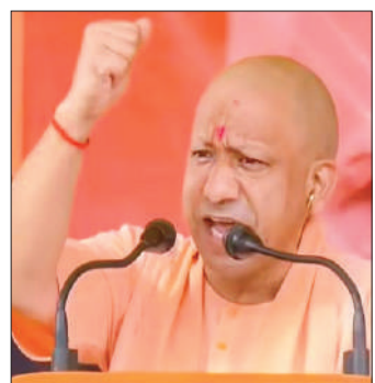
Altogether, three rallies were addressed by the firebrand leader in the poll-bound state, including two in Vaishali and Bhojpur districts.

"But for Rajendra babu, it was a matter of faith, and he said he would choose to give up his post rather than not attending the function," the Uttar Pradesh chief minister told the rally.