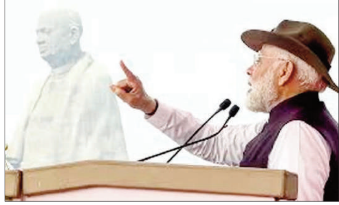
"Due to the Congress's weak policies, a part of Kashmir went under the illegal occupation of Pakistan, which then fueled state-sponsored terrorism. Kashmir and the country paid a heavy price, yet the Congress always bowed down to terrorism. The Congress forgot Sardar Patel's vision, but we have not," he told the gathering at the Rashtriya Ekta Diwas celebrations.

The PM's address focused heavily on national unity and security, infiltration of illegal immigrants, contrasting the "steely resolve" of Patel with the approach of post-independence governments, which he accused of adopting "spineless" policies.