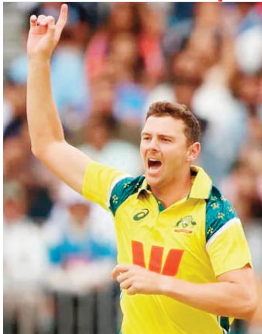
tials as world's numero uno T20 batter with some breathtaking strokes.

But with three matches left in the series, Indian batters could take a leaf out of Abhishek's book after he burnished his creden-