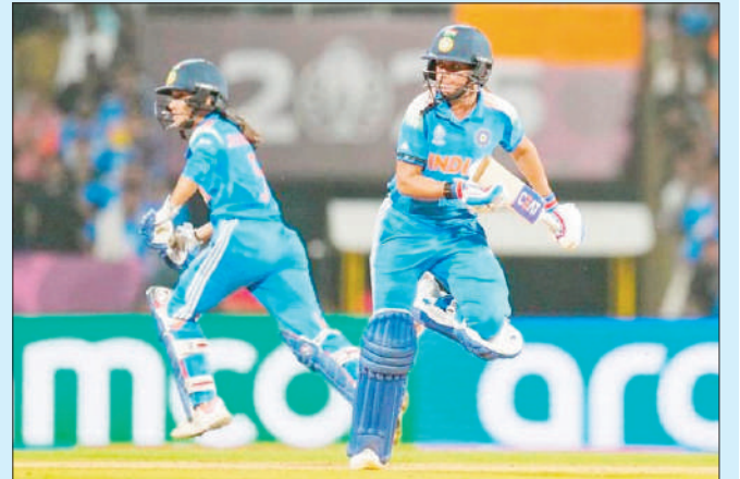
NAVI MUMBAI, Oct 31: The

country's sporting fraternity, led by the legendary Sachin Tendulkar, was in awe of India's record chase in the Women's ODI World Cup semifinal against Australia, terming it a fabulous victory which will remain etched in history.