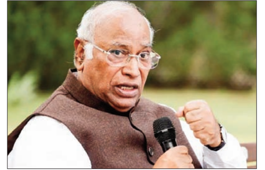
Gandhi, the Congress president said these two great leaders --? "iron man" and "iron lady" -- made a big contribution to the country and strived to maintain unity.

Noting that today is the birth anniversary of Patel and death anniversary of former prime minister Indira