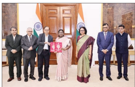
Governor T Rabi Sankar are part-time members.

The female workforce in rural areas has increased consistently for four months, reaching 36.9 per cent in October 2025 from 33.6 per cent in June 2025. The overall LFPR (labour force participation rate) among persons of age 15 years and above continued to increase for the four successive months to 55.4 per cent in October 2025 from 54.2 per cent recorded in June 2025. LFPR in rural areas also increased steadily from 56.1 per cent observed in June 2025 to 57.8 per cent in October 2025. Overall LFPR reached a six-month high of 55.4 per cent in October 2025, it stated. The overall LFPR among female aged 15 years and above reached 34.2 per cent in October 2025, marking the highest since May 2025, driven by the increase in female LFPR in rural areas. (PTI)