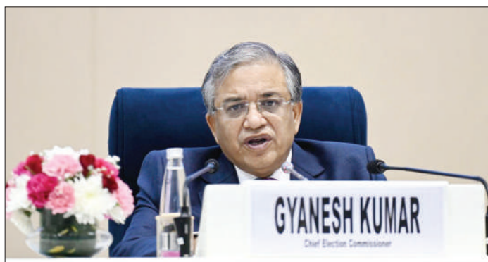
electoral rolls in the state and assured the government's full cooperation.

Assam Chief Minister Himanta Biswa Sarma welcomed the Election Commission's decision to undertake Special Revision of the