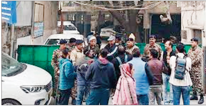
The official said "key" personnel overseeing finance and administration of the trust and the University have also been covered in the raids.

"The operation forms part of an ongoing investigation into financial irregularities, use of shell companies, accommodation entities and money laundering. The role of Al-Falah Trust and related entities is under investigation," an ED official said.