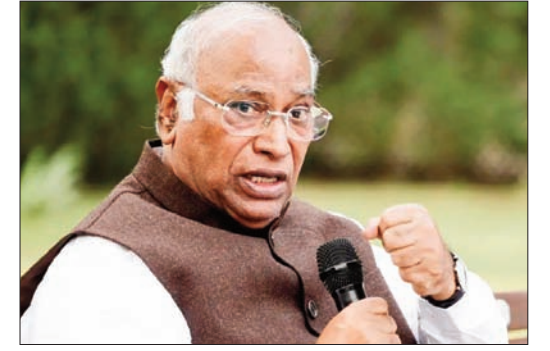
Congress president Mallikarjun Kharage on Friday said that in his personal opinion, the RSS should be banned as most law and order problems in the country are arising because of the BJP-RSS.

Noting that today is the birth anniversary of Patel and death anniversary of former prime minister Indira