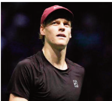
PARIS, Oct 31: Jannik Sinner beat Francisco Cerundolo 7-5, 6-1 in the third

round of the Paris Masters on Thursday to extend his indoor winning streak to 23 matches and maintain his chances of reclaiming the No. 1 ranking.