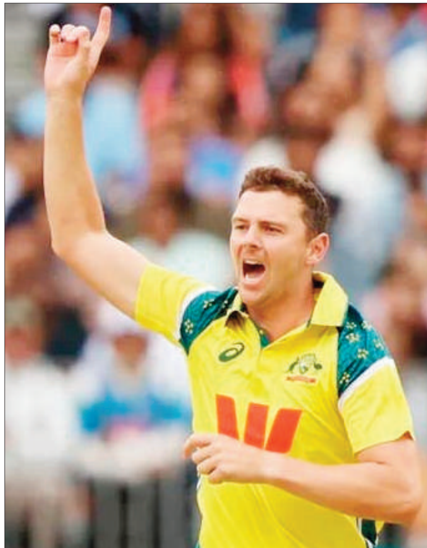
tials as world's numero uno T20 batter with some breathtaking strokes.

But with three matches left in the series, Indian batters could take a leaf out of Abhishek's book after he burnished his creden-