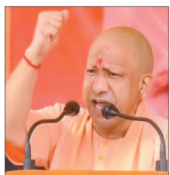
Uttar Pradesh Chief Minister Yogi Adityanath on Friday charged Congress' Prime Minister Jawahar Lal Nehru with having insulted Rajendra Prasad, the country's first President, by asking him not to attend the inauguration of a renovated Somnath temple.

"But for Rajendra babu, it was a matter of faith, and he said he would choose to give up his post rather than not attending the function," the Uttar Pradesh chief minister told the rally.