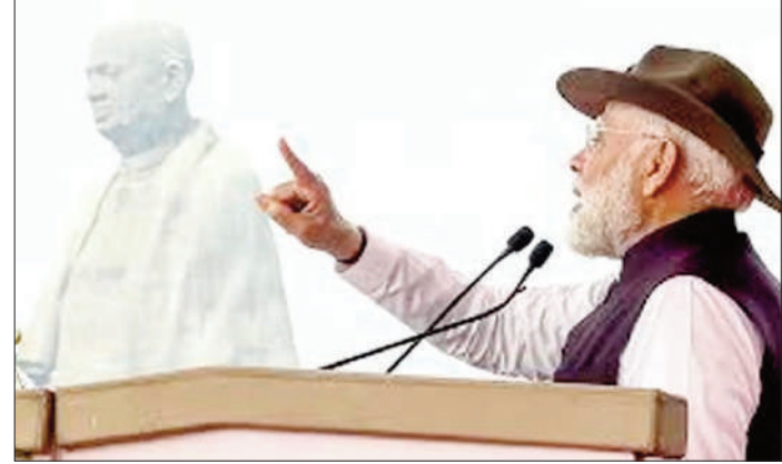
Prime Minister Narendra Modi on Friday launched a sharp attack on country's first premier Jawaharlal Nehru, claiming he prevented Sardar Vallabhbhai Patel from fully integrating Kashmir into the Indian Union.

The PM's address focused heavily on national unity and security, infiltration of illegal immigrants, contrasting the "steely resolve" of Patel with the approach of post-independence governments, which he accused of adopting "spineless" policies.