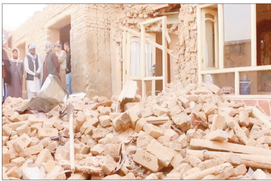
areas in Balkh and Samangan, which suffered the most damage, and were transporting the injured and assisting others.

In the Afghan capital of Kabul, the Ministry of Defence announced that rescue and emergency teams had reached the quake