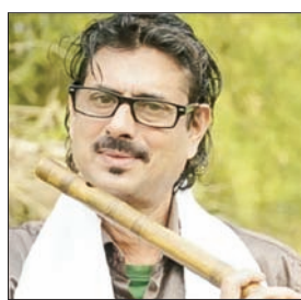
Ambikagiri Nagar in Guwahati.

From the airport, his mortal remains will be taken directly to his residence at