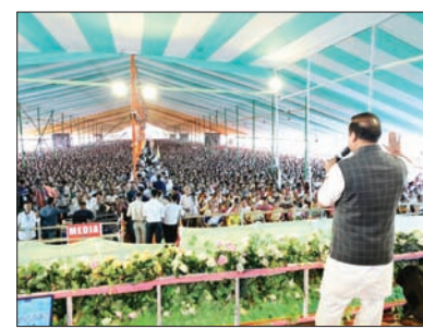
coverage and benefits have expanded.

Recalling the launch of the Orunodoi scheme before the previous Assembly election, the chief minister said that despite opposition criticism, the scheme's