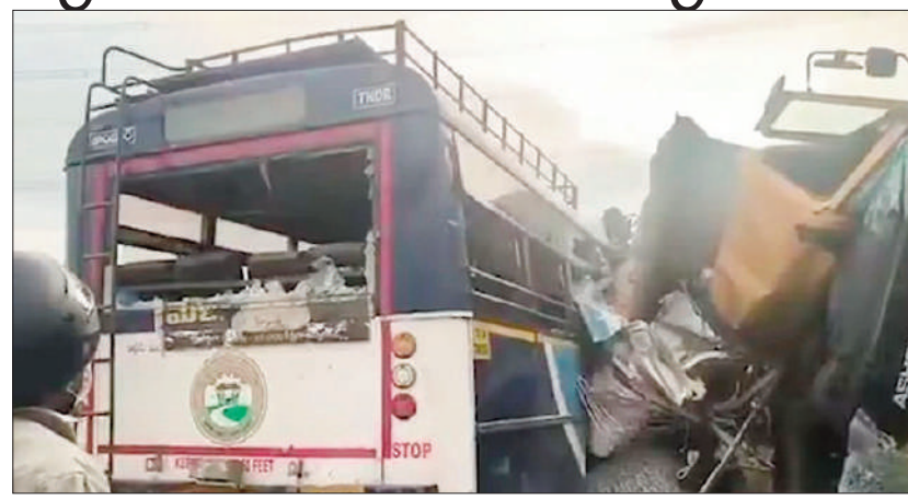
₹ 2 lakh each to the injured.

Soon after coming to know of the mishap, the Chief Minister instructed officials to take up relief measures on a war footing.