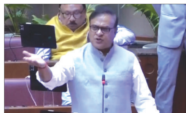
Garg and others helped that person. Four to five people are being booked in the murder case," Sarma claimed. "After the chargesheet in the murder case is submitted in December, the investigators

GUWAHATI, Nov 25: Chief Minister Himanta Biswa Sarma said in the assembly on Tuesday that singer Zubeen Garg's death while swimming in the sea in Singapore is a case of "plain and simple murder". The CM also claimed that one person killed Garg and the others helped him, while stating that four-five people will be booked in the murder case. The special investigation team (SIT), which is probing into the circumstances of Garg's death, has added murder charges to the case. The SIT has so far arrested seven people in connection with the singer's death. "One of the accused killed