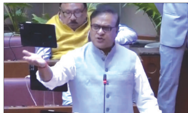
Garg and others helped that person. Four to five people are being booked in the murder case," Sarma claimed. "After the chargesheet in the murder case is submitted in December, the investigators

had ever betrayed Zubeen is spared," the chief minister said, without elaborating.