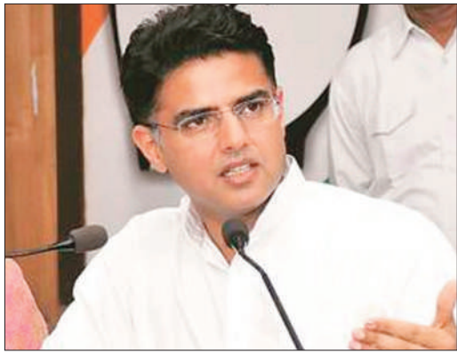
ness," he said.

"We want no genuine voter in this country to be excluded. We will keep up the pressure to ensure fair-