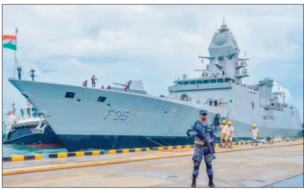
ived in Colombo for her maiden participation in SLN IFR 2025 -- a significant milestone in regional maritime cooperation. The warm reception sets the tone for deeper collaboration, enriched exchanges, and a strengthened maritime partnership." INS Vikrant's official X handle posted on Wednesday. It also shared some photographs of the indigenous aircraft carrier after its arrival in Colombo. The High Commission of

"India's first indigenous aircraft carrier, INS Vikrant, ar-