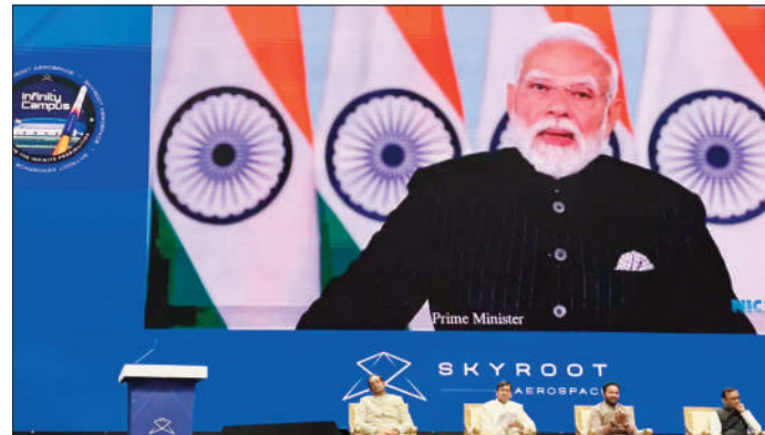
is expanding so much, covering the areas of communication, weather prediction, urban planning and national security, among others.

"India's private space talent is making its own identity in the world. Today, India's space sector is becoming an attractive destination for global investors. Today, the demand for small satellites is increasing rapidly in the world," Modi said. He traced the journey of the Indian space programme from its nascent stages -- where rocket parts were moved in a bicycle, to building the "most trusted launch vehicle." The journey might have started with limited resources but the growth proved determination decides dreams, Modi said. In these changing times, space sector