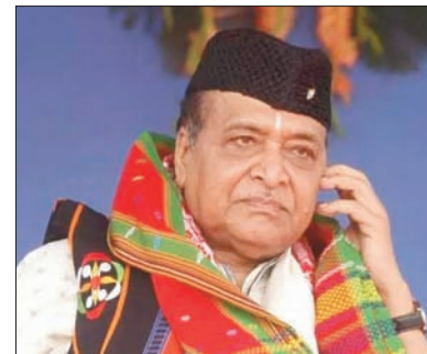
Dr. Bhupen Hazarika, the bard of the Brahmaputra, is shown in a portrait wearing a traditional Assamese cap and a colorful shawl.

In the modern world, various social, economic, and political problems have complicated human life. In such circumstances, this message of the song can make people conscious of their responsibilities. Through this historical and contemporary relevance, the enduring value of the philosophy of humanism is established. This background gives the song a special depth, which does not confine it within the limits of music alone but establishes it as a carrier of philosophical and social messages. This historical