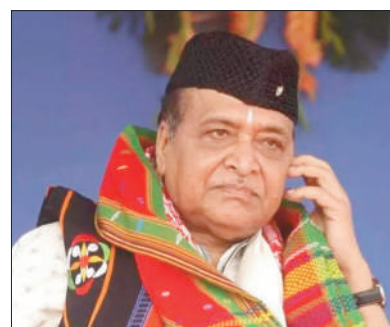
Dr. Bhupen Hazarika, the bard of the Brahmaputra, is shown in a portrait wearing a traditional Assamese cap and a colorful shawl.

In the modern world, various social, economic, and political problems have complicated human life. In such circumstances, this message of the song can make people conscious of their responsibilities. Through this historical and contemporary relevance, the enduring value of the philosophy of humanism is established. This background gives the song a special depth, which does not confine it within the limits of music alone but establishes it as a carrier of philosophical and social messages. This historical