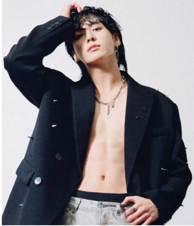
Moments" offer behind-the-scenes glimpses into his artistry and work ethic.

Other sections such as "Golden: Theater" and "Shine Cinema" spotlight his music videos and performances, while "Solid Cinema" and "Golden: