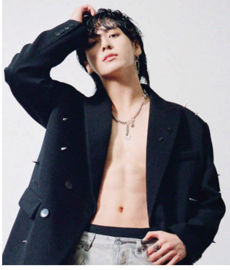
Moments" offer behind-the-scenes glimpses into his artistry and work ethic.

Other sections such as "Golden: Theater" and "Shine Cinema" spotlight his music videos and performances, while "Solid Cinema" and "Golden: