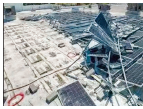
The CEEW studies also said that solar recycling in a formal setup remains unviable today, with re-

Rishabh Jain, Fellow, CEEW, said, "India's solar revolution can power a new green industrial opportunity. By embedding circularity into our clean energy systems, we can recover critical minerals, strengthen supply chains and create green jobs while turning potential waste into lasting value. Building this circular economy is most important for India's resilient and responsible