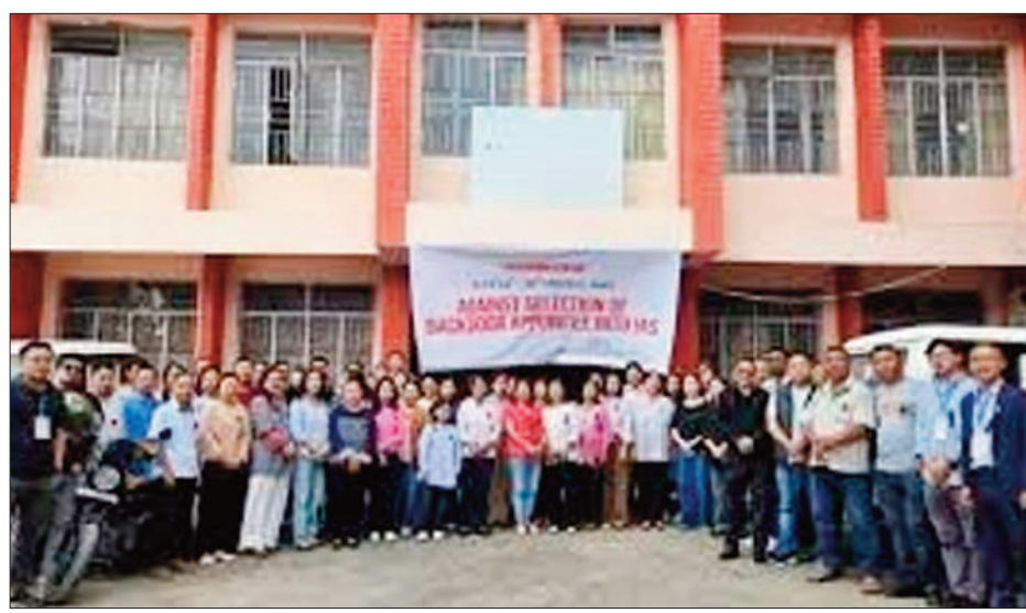
and confined to workplaces.

With the strike now expanded, the All Nagaland Government Drivers' Association, Nagaland Civil Secretariat Drivers' Association, All Nagaland Directorate & District Government Drivers' Union, and the Nagaland Civil Secretariat Grade-IV Staff Employees Association are actively participating in the tools down protest. The committee has instructed all its members across directorates and service associations to ensure that essential services – public transport, ambulances, educational institution vehicle service, sanitation, power and PHE services remain uninterrupted and that the protest remains peaceful