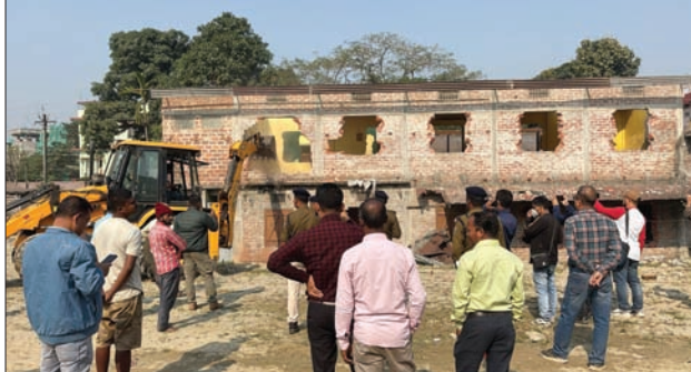
Amrit Bharat Station Scheme, aimed at improving passenger amenities and overall infrastructure. To facilitate smooth execution of the project, railway authorities initiated the eviction drive to clear encroached land around the station premises. Beginning early in the morning, a joint team comprising Kokrajhar Police, the Railway Protection Force (RPF) and railway officials conducted the operation in the presence of an executive magistrate. During the drive, several families and individuals who had illegally constructed residential houses and business establishments in and around the station area were evicted. Both residential and commercial structures were dismantled and removed. Authorities said the (CONTD. ON PAGE-2)

HT Correspondent KOKRAJHAR, Dec 23: A major eviction drive was carried out on Tuesday at Kokrajhar Railway Station to remove illegal encroachments on railway land, as part of large-scale infrastructure development and railway modernisation in the Bodoland Territorial Council region and Lower Assam. Official sources said several important railway stations across the BTC area and Lower Assam are set to be upgraded under central government initiatives. Plans are also underway to introduce train services connecting Kokrajhar with neighbouring Bhutan, a move expected to enhance regional connectivity, trade and tourism. Renovation and construction work at Kokrajhar Railway Station is currently progressing round the clock under the