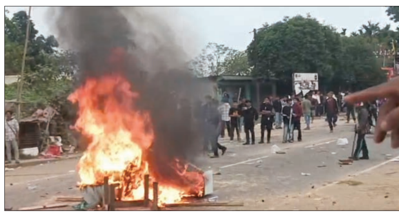
persons covering the incident, a senior police officer said. As the situation spiralled out of control, the police resorted to lathi charge and then fired tear gas shells to disperse both groups of protestors, he said.

DIPHU/GUWAHATI, Dec 23: Fresh violence erupted in Assam's trouble-torn Karbi Anglong district on Tuesday with at least eight people injured as two groups of protestors clashed and the police resorted to lathicharge and firing of tear-gas shells to disperse them, officials said. Despite prohibitory orders in force, a large number of people, including women and children whose shops were burnt by a mob on Monday, came out to protest against the violence, while the agitators demanding eviction of encroachers from the tribal belt also gathered in the Kheroni market area. Both the groups were agitated, and the security forces deployed in the area tried to pacify them, but suddenly stone pelting began from both sides, injuring several protestors, police personnel and media