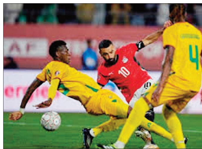
in November 2015.

The Bafana Bafana ended a six-game winless streak against Angola, which had won three and drawn three of their meetings since a World Cup qualifier