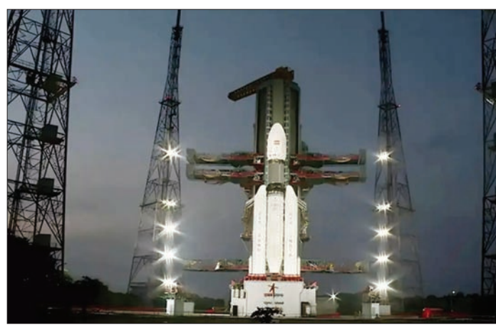
LVM3-M5 Communication Satellite 03, weighing about 4,400 kg that was successfully launched by ISRO on November 2 in the Geostationary Transfer Orbit (GTO). Wednesday's mission is being

SRIHARIKOTA (ANDHRA PRADESH), Dec 23: The 24-hour countdown for the launch of LVM3-M6 rocket, which will carry a new generation US communication satellite, commenced here on Tuesday, ISRO said. In a dedicated commercial mission, ISRO is scheduled to launch the Bluebird Block-2 spacecraft on board its heavy lift launch vehicle LVM3-M6 at 8.54 am from the second launch pad at this spaceport on Wednesday. Weighing 6,100 kg, the communication satellite would be the heaviest payload to be placed into the Low Earth Orbit (LEO) in LVM3 launch history, the Bengaluru-headquartered space agency said. The previous heaviest was the