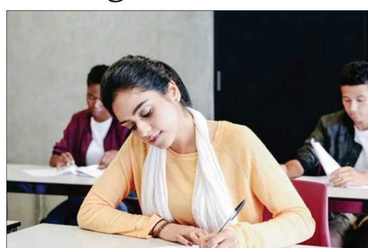
ing those from humanities (368), science (137), and medical science (73). The data shows that engineering graduates formed the largest cohort every

At the same time, engineering stream candidates continued to dominate the merit list, with 554 engineers recommended in 2023, far outnumber-