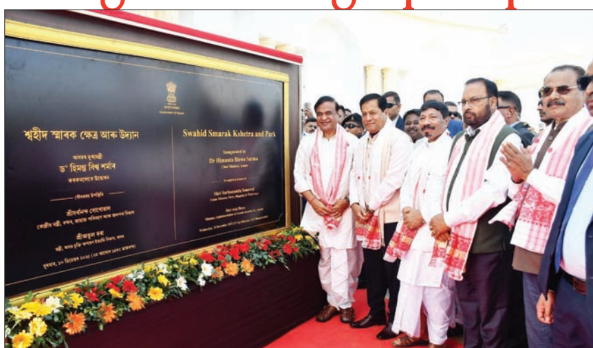
people of Assam and marking a major struggle to protect identity, pride, language, culture and heritage.

The movement has held a decisive place in the history of the state for many years, expressing the patriotism and sacrifice of the