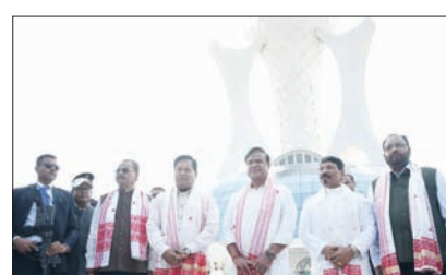
"The Assam Movement united the greater Assamese society for a national cause, and its spirit lives on today as an unending pledge to safeguard identity and existence," the Union minister of ports, shipping and waterways said.

Speaking on the occasion, Sonowal said the unparalleled sacrifice and courage of the martyrs would forever inspire generations to contribute meaningfully to the journey of nation-building while safeguarding land, language, culture, and identity.