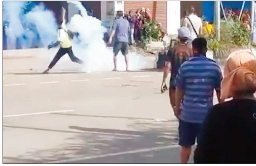
The counsel appearing for Singh said the other co-accused in the case were earlier granted bail. On September 15, the apex court sought the response of the NIA to ascertain the status of trial against Singh. The high court had denied him bail citing flight risk and the possibility of witnesses being influenced. "Considering the volatile situation that exists in Manipur and the circumstances that had earlier led to his release on bail, including the protests, it can clearly be said that enlarging the appellant on bail would not only entail flight risk but also the possibility of witnesses being influenced in the present case as also deterioration of law and order," it had said. The high court had said the NIA has established a prima facie case against Singh, supported by material evidence indicating his involvement in the alleged offences. Singh was arrested in September 2023

The top court passed the order on a plea filed by Singh challenging an April 2 order of the Delhi High Court which had denied him bail. The bench directed that Singh be released on bail in the case on such terms and conditions as may be imposed by the trial court.