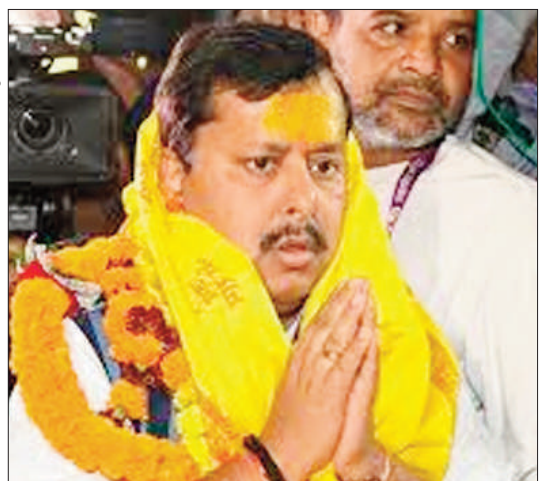
karyakartas work 24x7."

On the question of the party's strategy for the West Bengal elections, he said, "Be it Bengal, Assam or Uttar Pradesh, our party workers are always ready. This is the beauty of Bharatiya Janata Party. Others work during elections, but BJP