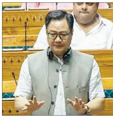
ers criticise each other in different ways.

Rijju said the political leaders wish each other in public despite political fights, which are separate issues, and lead-