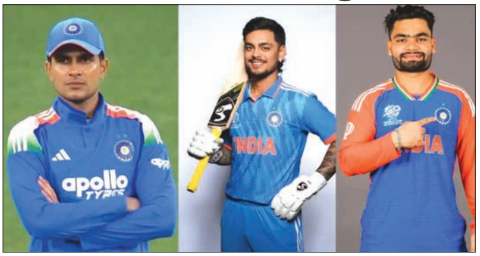
ing-batters at the top.

"Shubman Gill is short of runs at the moment and missed last WC too," chairman of selectors Ajit Agarkar said at the press conference. In contrast, Ishan's return reflects the selectors' renewed emphasis on left-right combinations and aggressive wicket-keep-