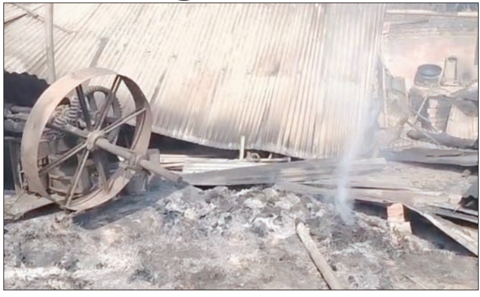
After deploying five more CRPF companies in the area, security forces conducted a joint flag march in the morning, he added. The Karbi and Bihari communities have been at loggerheads over allegations of encroachment on the Village Grazing Reserve (VGR) and Professional Grazing Reserve (PGR) in tribal belts by the Hindi-speaking people. "In the morning, Karbi people gathered at Thelampi in Kheroni and took out a procession towards Dongkamukam. They reached the bridge (CONTD. ON PAGE 2)