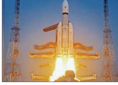
dian soil was done so using the LVM3 rocket, ISRO said. Prime Minister Narendra Modi congratulated ISRO for its latest feat. "A significant stride in India's space sector. The successful LVM3-M6 launch,

SRIHARIKOTA (ANDHRA PRADESH), Dec 24: In a historic Christmas eve mission, ISRO's "Bahubali" rocket on Wednesday successfully launched a 6,100 kg US communication satellite-- the heaviest by an Indian launcher, into the desired orbit, a feat described by the space agency as the season's gift to the country. The BlueBird Block-2 satellite is part of a constellation of global Low Earth Orbit (LEO) mission to provide direct-to-mobile connectivity through satellite that would enable 4G and 5G voice and video calls, texts, streaming and data for everyone, everywhere at all times. The heaviest satellite to be launched from In-