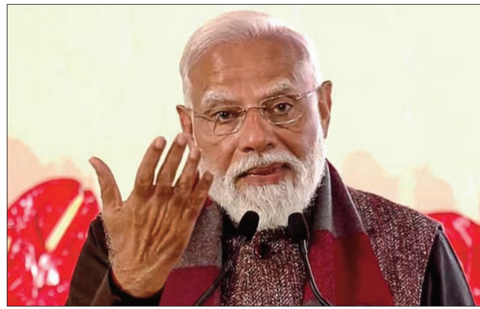
Veer Bal Diwas.

On the Prakash Purab (birth anniversary) of Sri Guru Gobind Singh on January 9, 2022, Modi had announced that December 26 would be observed as Veer Bal Diwas to commemorate the martyrdom of Sahibzades Baba Zorawar Singh and Baba Fateh Singh, whose unparalleled sacrifice continues to inspire generations. The government is organising programmes across the country aimed at informing and educating citizens about the extraordinary courage and supreme sacrifice of the Sahibzades to mark