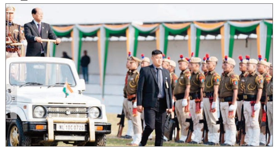
Supporting media professionals, tablet computers were distributed to accredited journalists. The chief minister also flagged off 10 sanitation vehicles to urban local bodies to streamline waste management. The programme featured special presentations including "Cantate Domino" by Cantabile and "Warrior's Call" by The Dream Team, followed by cultural performances from Meriema (Angami), Zhove (Chakhesang), Shena Old (Sumi), and Tikhir Cultural Troupe, Kohima. The event also included the inauguration of an exhibition titled "Journey of Nagaland Down the Decades", set up by the Directorate of Information & Public Relations.