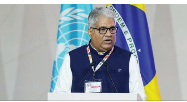
a complete transition from fossil fuels. "India supports consensus-based decision-making initiatives

GUWAHATI, Dec 1: Union Environment Minister Bhupender Yadav called for consensus-based decisions to resolve global climate issues, and said negotiations become "complicated" when developed nations do not perform as per their historical responsibilities and resist equitable distribution of carbon space. Yadav, who led the Indian delegation at the recently held UN COP30 Climate Summit in Brazil, said ensuring energy security for the Global South is essential while deciding a roadmap for