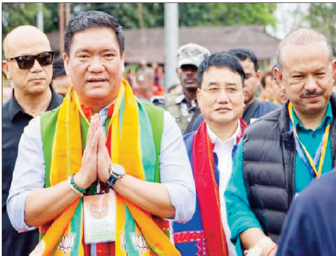
ITANAGAR, Dec 1: Chief Minister Pema Khandu on Monday lauded the unopposed victory of BJP candidates in the run-up to the state's December 15 panchayat and municipal elections, describing it as a reflection of the public's confidence in the party's development

58 ZPMs, 4 IMC corporators and over 5,000 Gram Panchayat members secure uncontested wins