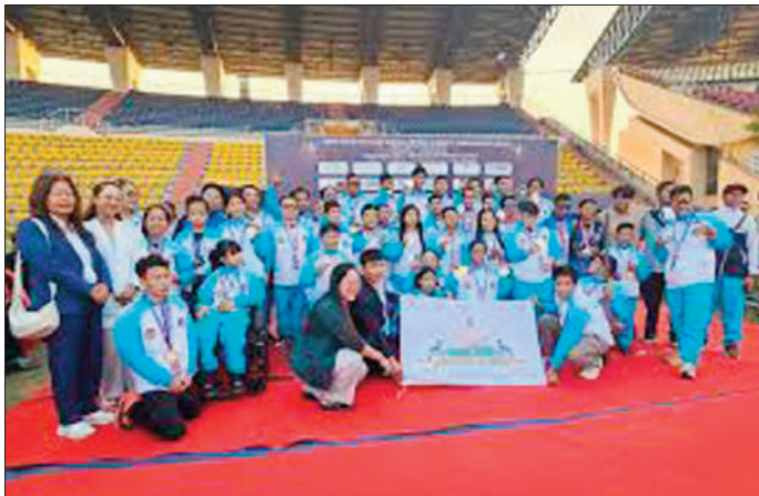
ITANAGAR, Dec 1: Chief Minister Pema Khandu on Monday hailed the state's para-athletes for delivering a "historic performance" at the second North East Para Games in Guwahati.

The Arunachal Pradesh contingent finished runner-up in the overall medal tally with an impressive haul of 84 medals.