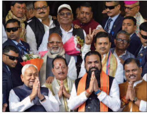
PATNA, Dec 1: The 18th Bihar Legislative Assembly commenced on Monday with newly elected members being administered the oath of office.