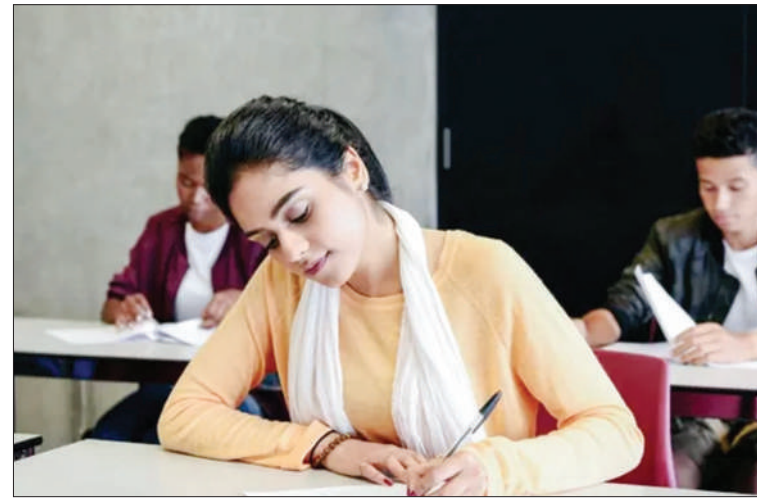
The data shows that engineering graduates formed the largest cohort every

NEW DELHI, Dec 10: The proportion of women qualifying for the Civil Services Examination (CSE) has increased from 24 per cent in 2019 to 35 per cent in 2023, the government told Lok Sabha on Wednesday. Engineering graduates consistently accounted for more than 50 per cent of successful candidates, data presented by Minister of State for Personnel, Public Grievances and Pensions Jitenendra Singh showed. Responding to a question, the minister presented five-year data showing a steady rise in the number of female candidates in the final merit list — from 220 out of 922 candidates in 2019 to 397 out of 1,132 in 2023. At the same time, engineering stream candidates continued to dominate the merit list, with 554 engineers recommended in 2023, far outnumbering those from humanities (368), science (137), and medical science (73).