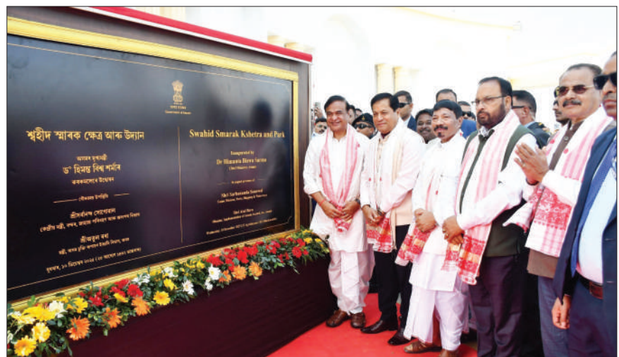
people of Assam and marking a major struggle to protect identity, pride, language, culture and heritage. He said that each martyr who gave his life

HT Bureau GUWAHATI, Dec 10: Amidst the melody of Dr Bhupen Hazarika's timeless creation Swahid Pranamu Tumak reverberating through the air, chief minister Himanta Biswa Sarma on Wednesday inaugurated the Swahid Smarak Kshetra at Paschim Boragaon on the occasion of Swahid Divas. The Smarak Kshetra has been built as a heartfelt tribute to the sons and daughters of Assam who laid down their lives to protect the identity of the state. The chief minister offered shradhdhanjali to the Bir Swahids of the Assam Movement at the Swahid Pranam Jyoti and interacted with the families of the martyrs. Speaking on the occasion, chief minister Sarma said that the historic Assam Movement, which focussed on the expulsion of foreigners, began during a difficult period for Assam. The movement has held a decisive place in the history of the state for many years, expressing the patriotism and sacrifice of the