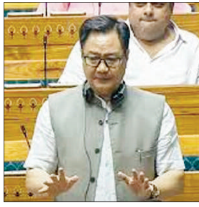
ers criticise each other in different ways.

Rijju said the political leaders wish each other in public despite political fights, which are separate issues, and lead-