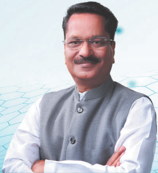
Shri Ashok Singhal Minister, Health & Family Welfare etc., Assam