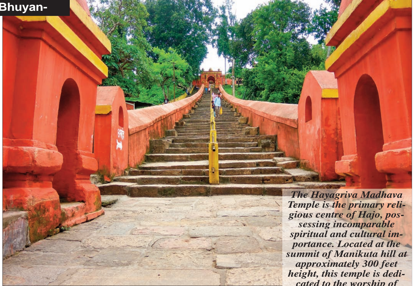
The Hayagriva Madhava Temple is the primary religious centre of Hajo, possessing incomparable spiritual and cultural importance. Located at the summit of Manikuta hill at approximately 300 feet height, this temple is dedicated to the worship of Lord Vishnu's Hayagriva avatar. "Hay" means horse and "griva" means neck, thus Hayagriva signifies Vishnu's avatar with a horse's neck. According to a mythological story in the Kalika Purana, two demons named Madhu and Kaitabha stole the four Vedas from Brahma at the beginning of creation and took them to the netherworld

temple is a large pond named Apurnabhava, where devotees wash their hands and feet before entering. The fish and tortoises in this pond are considered symbols of Vishnu's Matsya and Kurma avatars. At the temple entrance, a Hanuman statue and the lion gate enhance its artistic beauty.