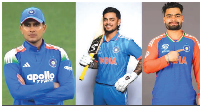
ing-batters at the top.

"Shubman Gill is short of runs at the moment and missed last WC too," chairman of selectors Ajit Agarkar said at the press conference. In contrast, Ishan's return reflects the selectors' renewed emphasis on left-right combinations and aggressive wicket-keep-