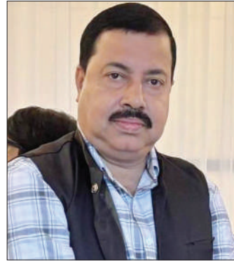
HT Bureau GUWAHATI, Dec 23:

Two-day meeting at Kalakshetra to chart roadmap for 2026 Assembly polls