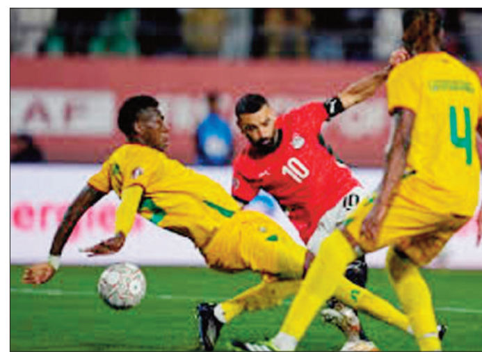
in November 2015. South Africa's Oswin Appollis opened the scoring in Marrakech with a low strike inside the left

mouh, and Mostafa Mohamed — who had gone on for the ineffective Ashour — all had efforts blocked before the break. The game resumed in the same manner after until Marmouh finally found a way to score from a difficult angle in the 64th. Salah's winner gave the Pharaohs three points in Group B. The Liverpool star has never won Africa's premier competition. This is his fifth edition. South Africa also wins Lyle Foster earned South Africa a hard-fought 2-1 over Angola in the other group game. The Bafana Bafana ended a six-game winless streak against Angola, which had won three and drawn three of their meetings since a World Cup qualifier