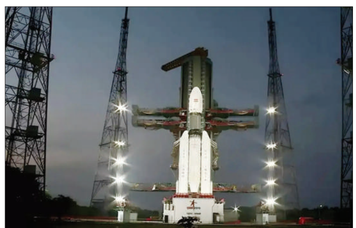
LVM3-M5 Communication Satellite 03, weighing about 4,400 kg that was successfully launched by ISRO on November 2 in the Geostationary Transfer Orbit (GTO). Wednesday's mission is being

undertaken as part of the commercial agreement signed between NewSpace India Ltd (NSIL) and US-based AST SpaceMobile (AST and Science, LLC). NewSpace India Ltd is the commercial arm of ISRO.