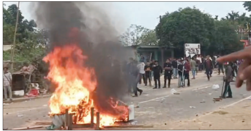
persons covering the incident, a senior police officer said. As the situation spiralled out of control, the police resorted to lathi charge and then fired tear gas shells to disperse both groups of protesters, he said.

Both the groups were agitated, and the security forces deployed in the area tried to pacify them, but suddenly stone pelting began from both sides, injuring several protestors, police personnel and media