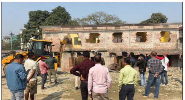
Amrit Bharat Station Scheme, aimed at improving passenger amenities and overall infrastructure.

Renovation and construction work at Kokrajhar Railway Station is currently progressing round the clock under the