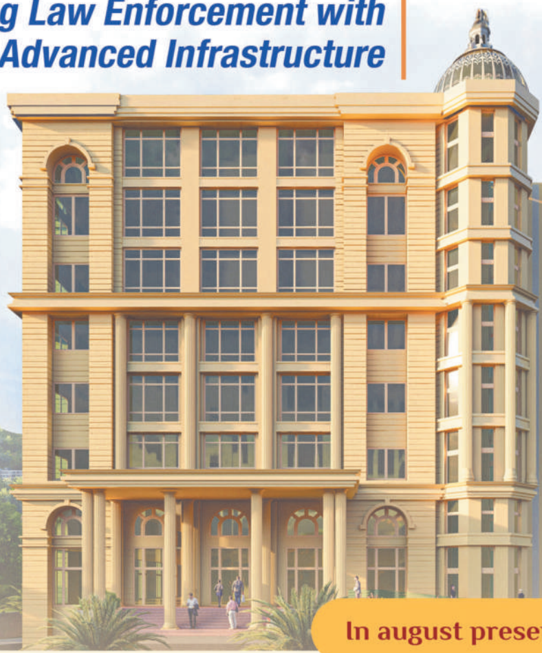
In august presence of

Shri Amit Shah Union Home Minister & Minister of Cooperation