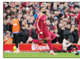
Salah celebrated with teammates after scoring a goal for Liverpool.

However, a few days later, Salah was back in the squad for the Brighton game after he held con-