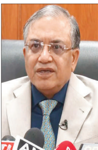
global democratic processes, supporting electoral management bodies and fostering democratic norms through research and ca-

Established in 1995, International IDEA is an inter-governmental body comprising 35 member countries, with the United States and Japan serving as observers. The organisation has held observer status at the UN General Assembly since 2003. Its mandate includes strengthening