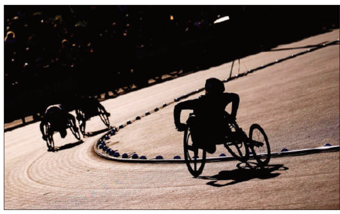
staff and wheelchair escorts" during big events. Although no case of athletes leaving the contingent have come to light, there have been complaints of officials treating foreign competitors as "paid for holidays." "At the Asian Para Table Tennis Championships (in October), a wheelchair-bound coach took his son as his escort and the duo disappeared for the duration of the competition in Beijing. They were busy shopping and sight-seeing,