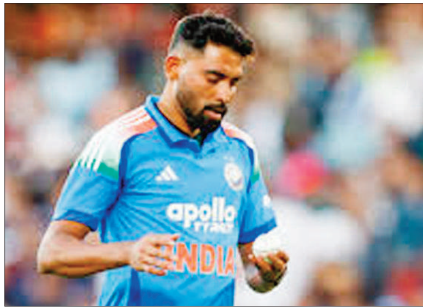
"Shreyas Iyer's availability is subject to fitness clearance from BCCI COE," said the BCCI in a statement.

The other two matches will be played in Rajkot and Indore on January 14 and 18 respectively.