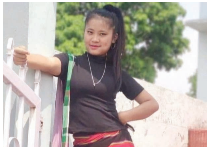
sisted by local volunteers after she went missing from her residence on December 1.

The highly decomposed body of Marina, a resident of Tahnrl in the western outskirts of Aizawl, was recovered near MZU football ground on December 13 following intensive search by police as-