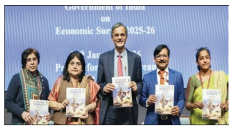
Prime Minister Narendra Modi (center) with other officials holding copies of the Economic Survey 2025-26.

"It also raises a substantial question about the